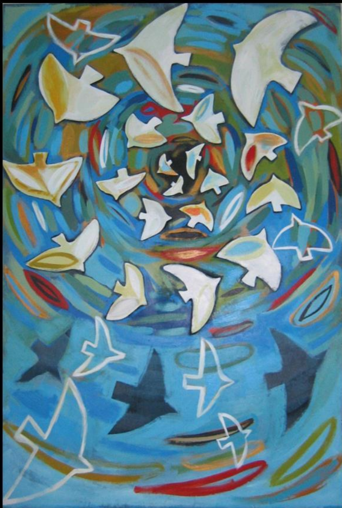
Left: "Sweeping Movement"