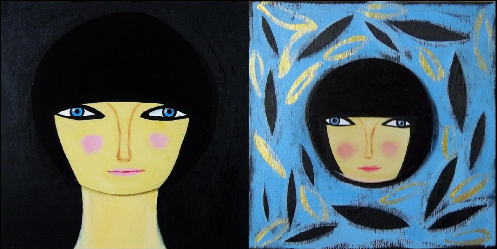
“Faces” From the solo exhibition at Beit Gavriel Gallery, Tiberias. 40x20 cm. Acrylic on wood, relief.