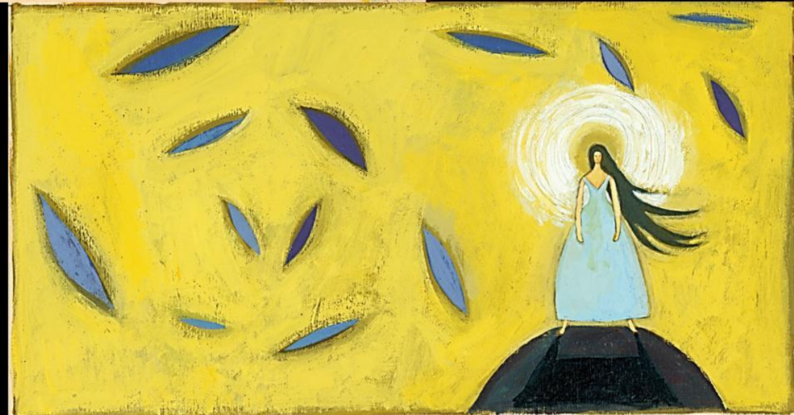
Nomi's illustrations from the book "Purple Leaves, Red Cherries"