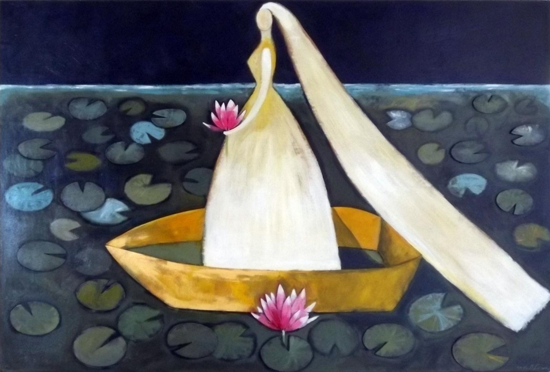
“Coming Back” From the solo exhibition at The Jerusalem Theater. 180x120 cm. Acrylic on wood, relief.